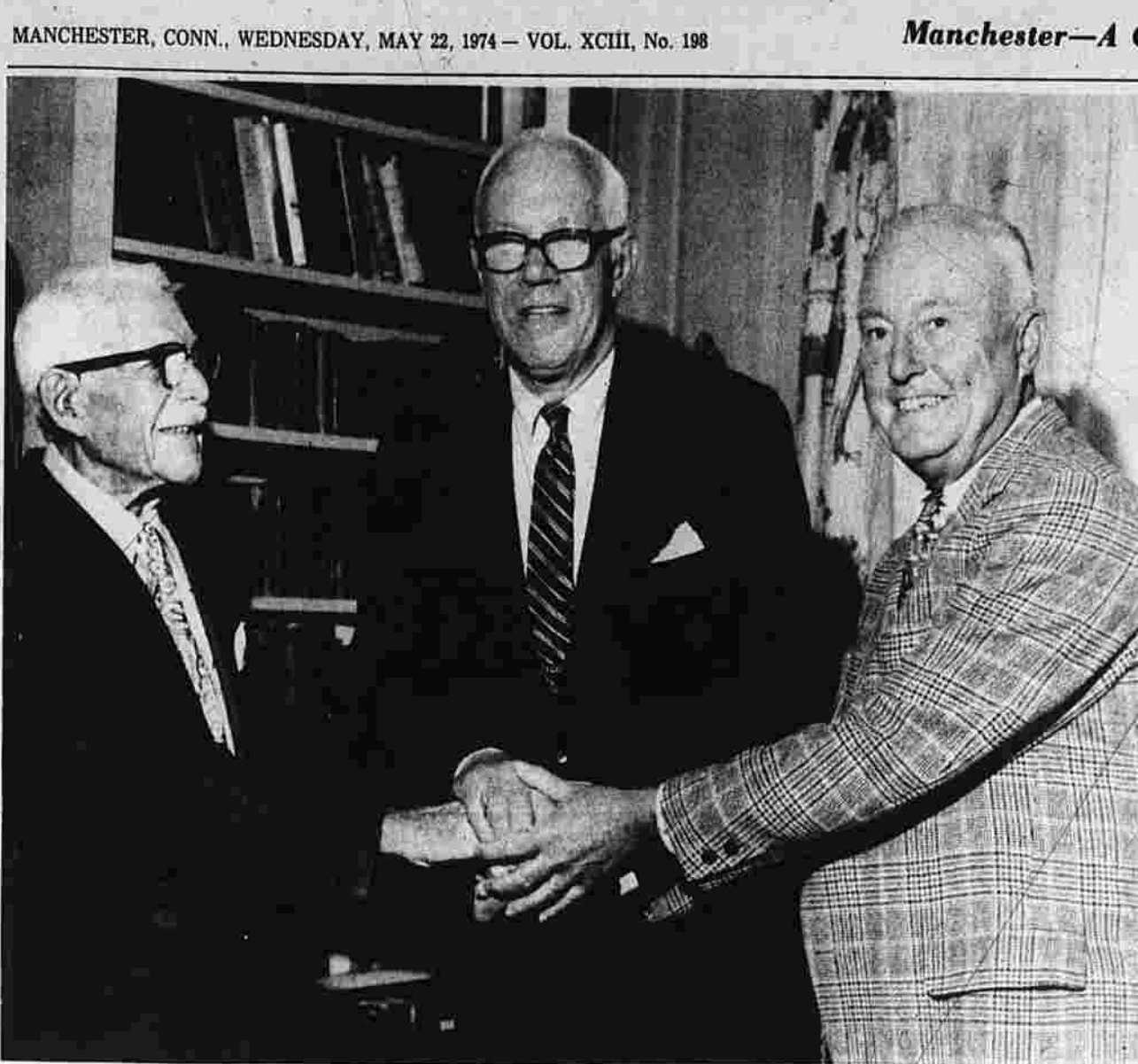
Generations of Public Service